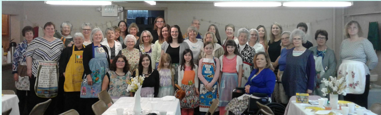
This year's participants at our Ladies' Spring Tea enjoying a wonderful morning together.

Looks like the adults may have beaten our youth in this year's food drive for the Salvation Army. Oh well, there is always next year! The youth will be delivering this year's food drive items to the La Porte Salvation Army during the first week of May.